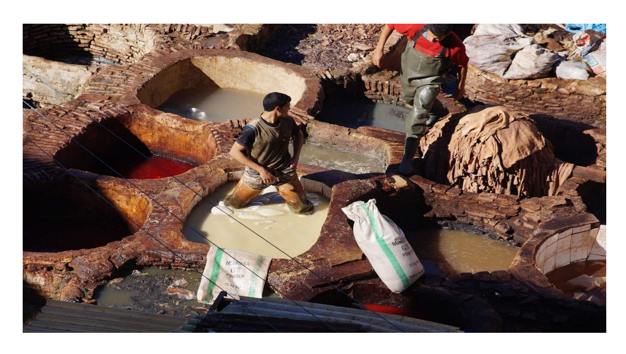
Fes - LeatherTannery

The 'blue city', is one of the prettiest places in Morocco. A stroll through the ancient medina is a must for shopping. After Lunch, drive towards Fes. Enroute, stop for a panoramic view of this medieval city. On arrival, enjoy the Jewish quarter or mellah built in 1438. Marriott Jnan Palace https://www.marriott.com/en-us/hotels/fezmc-fes-marriott-hotel-jnan-palace/overview/