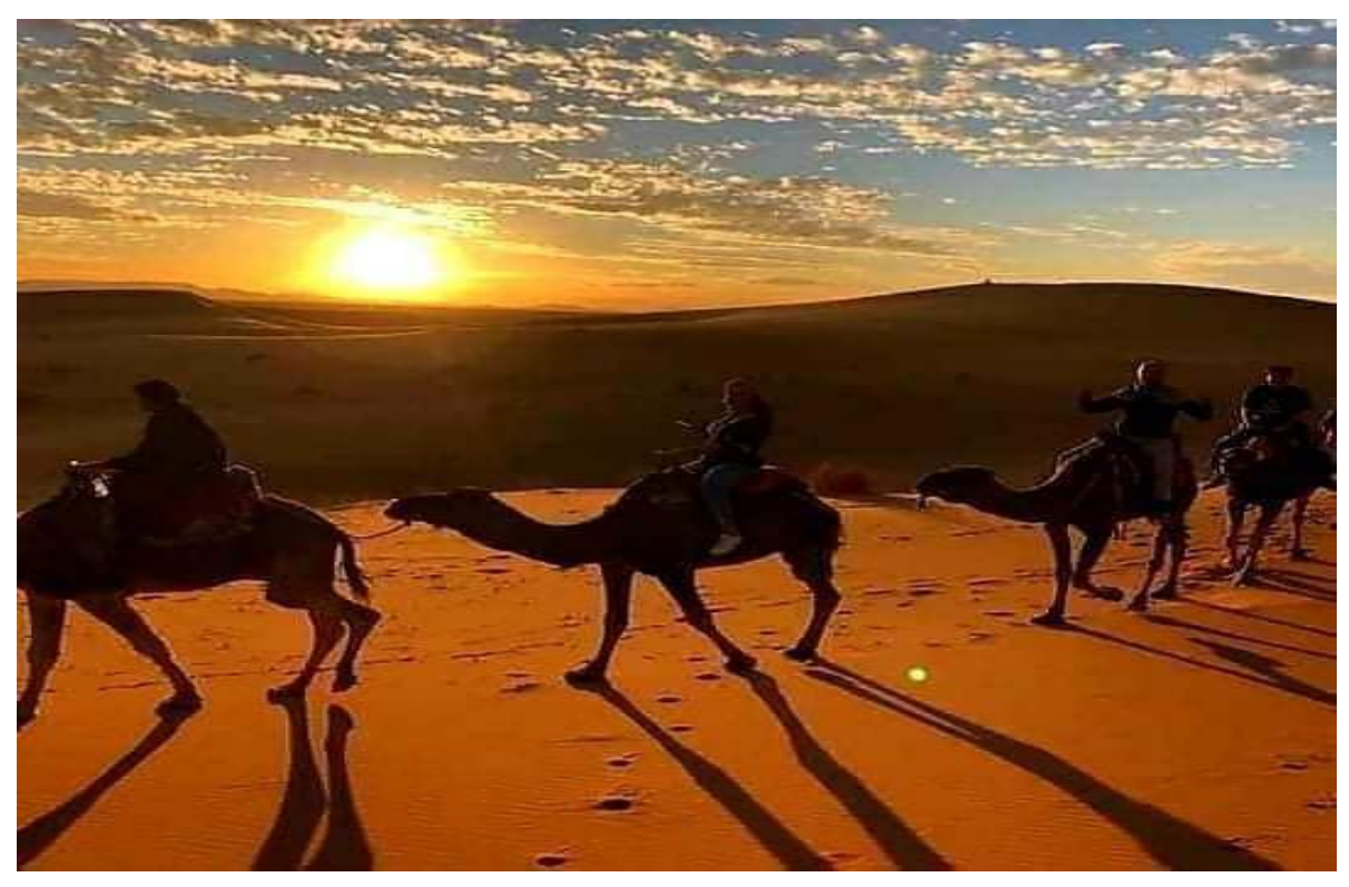
The greatest desert on Earth - The Sahara